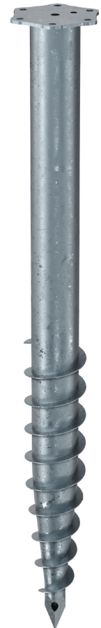
KSF M 76x2,6x1000 M12 HDG